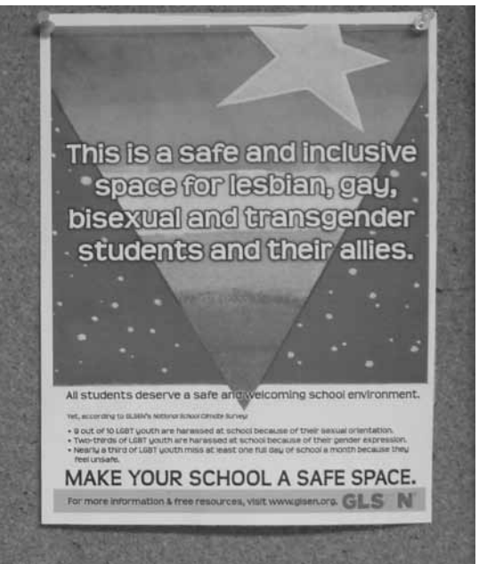
A copy of the poster in question

The posters identify classrooms as spaces where all students can feel safe from bullying and harassment, regardless of sexual orientation or gender identity. Members of the Central